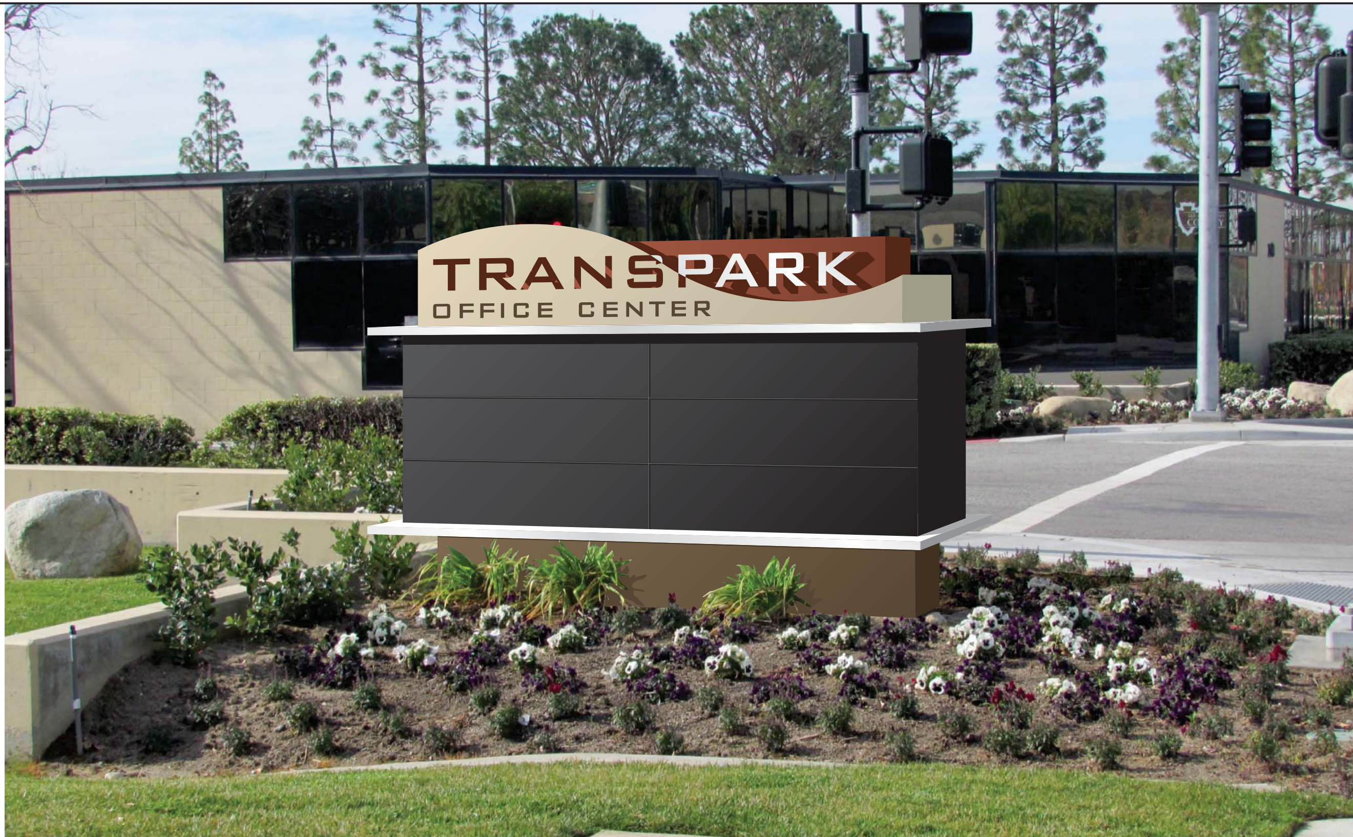
New Double-Face Internally Lighted Monument Sign - Alternate Color