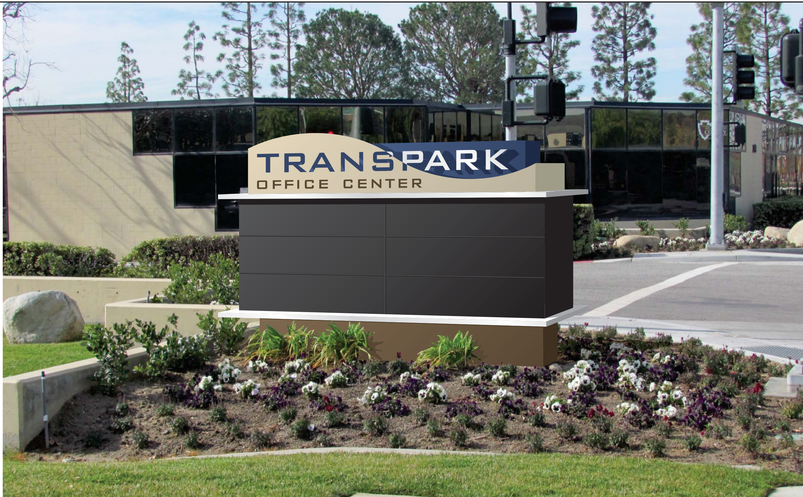
New Double-Face Internally Lighted Monument Sign